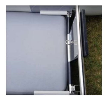
Insert D-Rings on the bottom of the air deck floor, through the slots in the boat floor fabric layer. Lash the two D-Rings together with the included webbing strap.