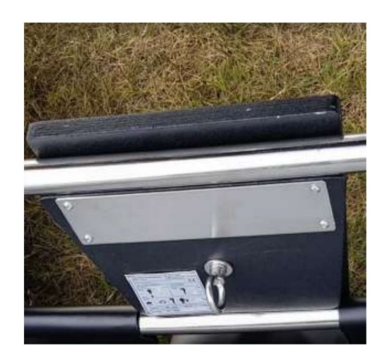
Tighten firmly by hand, no tools required!